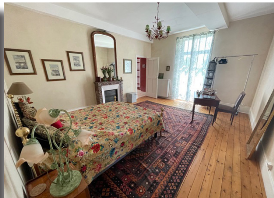
The Vintner Estate Home in Buxy